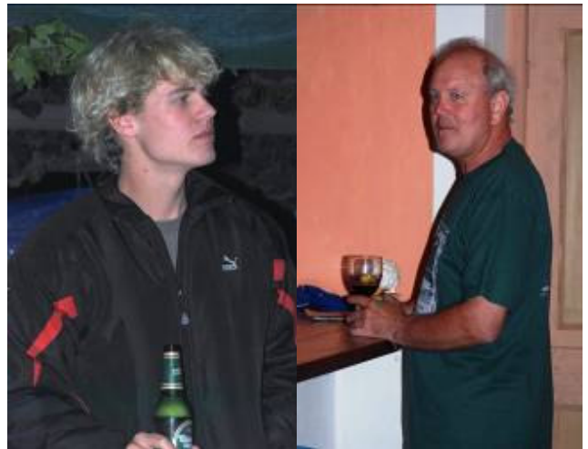
Enjoying the earlier, more civilised entertainment

Soon after supper was served. What a meal, fillet steaks to perfection, pasta and vegetable salads, breads and dessert.