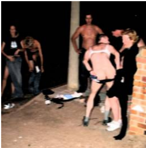
An artist's impression of what allegedly took place on a dark street after midnight in Porterville at the Black Gatskop. The artist might have been drinking, so his memory can not be relied upon.