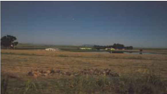
Dusk at the Flyers Lodge