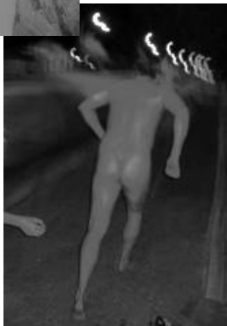
The Main Road Streak