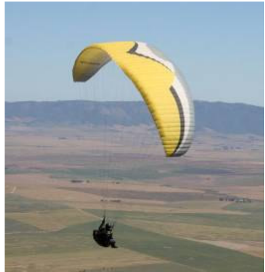
loel - just after taking off

Saturday morning produced the typical summer Swartland sunrise, blue skies and calm air; there was no sign of the cold front that was going to hit us later in the day. The sun was beating down onto the golden wheatfields, the air was clear. A few pilots drove to the top of the Dasklip pass where the wind was side on and fairly strong already. Earl and loel launched and had 10-minute foefies and soon after they had landed the wind had picked up to gale force, which confirmed the coming of the front.